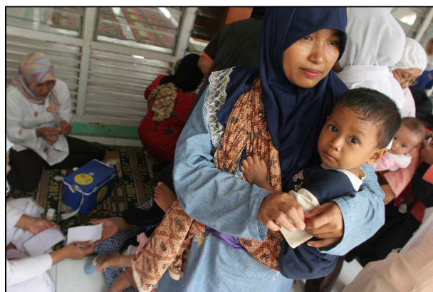
In Indonesia, an important component of CARE's tsunami response involved providing essential health services to mothers and children. Our work contributed to significant reductions in severe malnutrition in affected communities.

Over the medium term , CARE continued to improve access to sustainable, high quality, and appropriate water and sanitation resources in tsunami-affected communities. In addition to rebuilding infrastructure, we educated community members about proper hygiene and trained them to manage and maintain the systems once CARE was gone. In sum, we rehabilitated 1,026 water systems and constructed 729 sanitation facilities. We also trained local people, especially women, to advocate for their rights and hold leaders accountable for ensuring equal access to services.