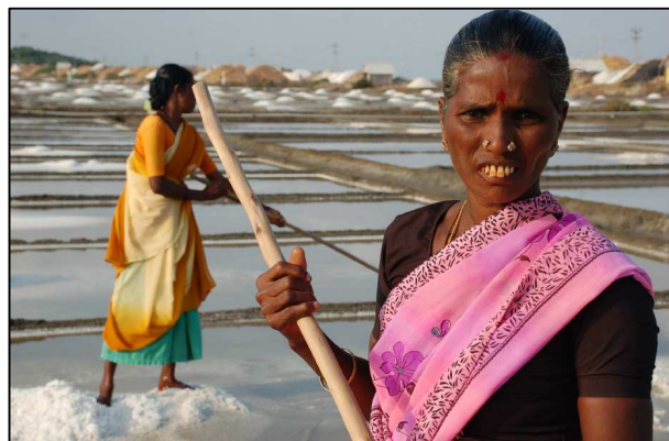
In India, as in other tsunami-affected countries, CARE focused on helping the most vulnerable people, including women and those from marginalized social groups.

In India, the southeastern states of Andhra Pradesh and Tamil Nadu and the Andaman and Nicobar Islands felt the brunt of the tsunami. More than 10,000 people were killed and over 2.8 million survivors faced massive damage, loss and trauma. CARE, which has worked in India since 1950, began responding in December 2004 immediately after the disaster. Our response was organized into three phases that spanned immediate relief efforts to long-term rehabilitation and economic development.