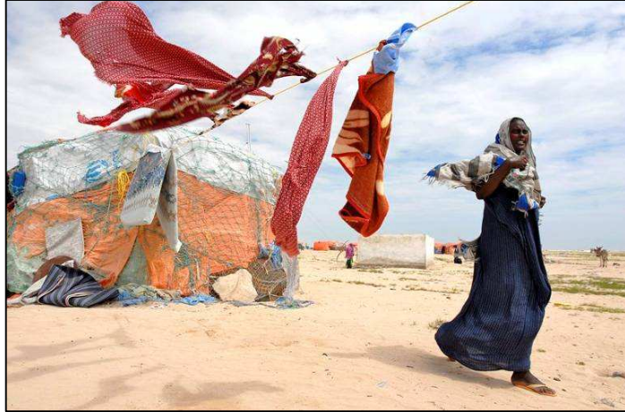
Residents in Somalia's coastal communities felt the tsunami's impact. Homes, fishing boats and infrastructure were destroyed.

Africa's eastern coast also felt the impacts of the Indian Ocean tsunami, such was its power. In Somalia, one of the poorest and most unstable countries in the world, some 300 people died and 44,000 people were affected. In the immediate term , CARE responded quickly by distributing 491 tons of food to 70 percent of the affected households. The tsunami destroyed nearly all of the shallow wells in the coastal area, resulting in an acute shortage of drinking water. In response, CARE delivered water to more than 5,000 families in 45 communities.