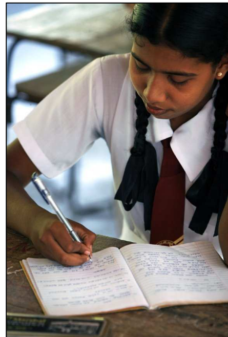
In Sri Lanka, CARE helped to rebuild schools and provided supplies to help students and teachers get back to the classroom as soon as possible.

In total, we helped more than 5,000 families with transitional or permanent housing and ensured that 25,000 families gained access to clean water . Additionally, we constructed toilets to serve some 7,000 families. To help revitalize local economies and allow affected families to generate increased income, we launched a diverse range of livelihood initiatives that provided the poorest and most affected residents