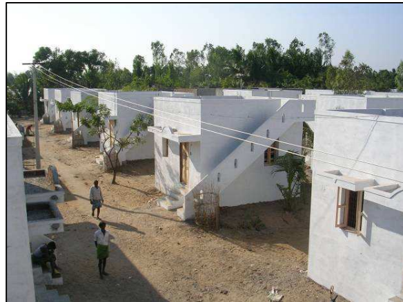
The houses that CARE built for tsunami-affected families, such as these, were designed with the input of future occupants.

During this period, CARE also constructed over 1,800 permanent homes for tsunami-affected families and worked with local governments to link the homes to other important infrastructure like roads, sewage systems, drinking water and electricity. CARE involved communities in the design of the houses and constructed them according to government and Sphere standards. 1 All houses were provided with water and sanitation facilities.