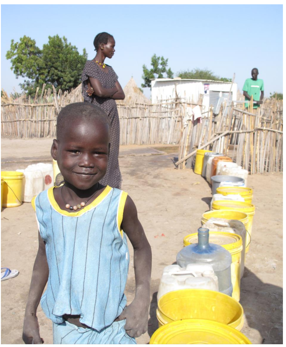
Girl at repaired borehole, Leer Town.

South Sudanese live in an environment in which livelihoods are constantly under threat: by climatic shocks, by conflict, and by a fluctuating global economy. Income shocks over the past year have been particularly harsh, and more than three million people throughout the country are either moderately or severely food insecure. Thousands of households engage in harmful coping strategies — including reducing food intake, selling productive assets, taking children out of school, and going into debt. With food prices continuing to rise, an ongoing influx of returnees and security continuing to deteriorate, food security levels could easily decline further — pushing more and more households towards these and other harmful coping strategies.