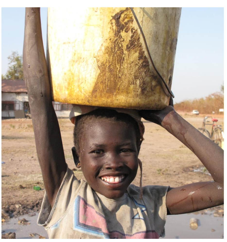
Girl getting water in Rumbek, 2010.

Amidst jubilant celebration, the new Republic of South Sudan entered the international stage in July 2011 albeit as one of the least developed countries in the world. The challenges and opportunities are enormous, and donors, the government, implementing agencies and most importantly the people of South Sudan have a lot at stake – but much more to gain. This paper presents ten areas for action based on the experience of NGOs operating in South Sudan and lessons learnt during the Comprehensive Peace Agreement interim period. Donors must prioritise them in the first years of the country's independence so as to ensure the best possible results for the people of South Sudan.