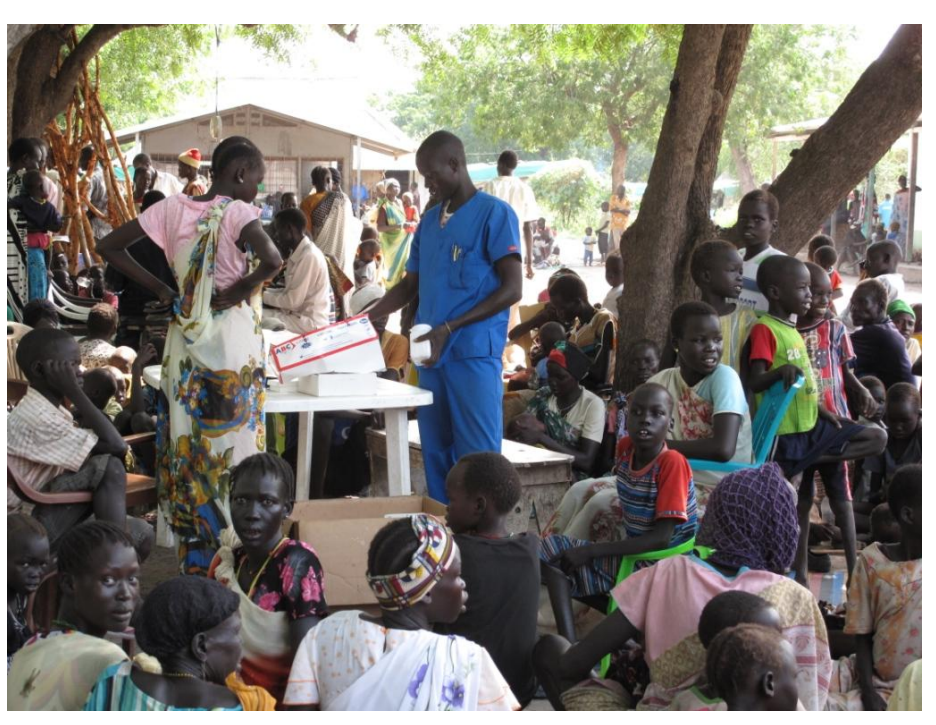
Emergency Response Team - Old Fangak, Jonglei State, October 2010

The importance of fostering the participation of local communities and a range of CSOs including women's, youth, and faith-based and church groups in the development of South Sudan cannot be overstated. Community participation enhances the relevance and sustainability of development initiatives; while a strong civil society facilitates good governance by increasing the likelihood of local authorities being held accountable to the people.