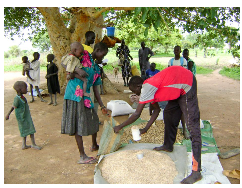
A woman receives local seeds of her choice in Warrap State, South Sudan. World Vision distributes seed coupons to help the community's poorest people buy seeds of their choice locally.

Throughout the CPA interim period, humanitarian and development assistance in South Sudan has in large part consisted of single sector interventions, in many cases focused on the symptoms of a problem rather than addressing what is almost always a multiplicity of underlying causes. This is perhaps attributable to the multitude of challenges and complexities that have been described throughout this paper: an everchanging context that fails to sit neatly in a humanitarian, recovery or development box; an enormously challenging operating environment; and the difficulty of understanding the drivers and dynamics of the conflict.