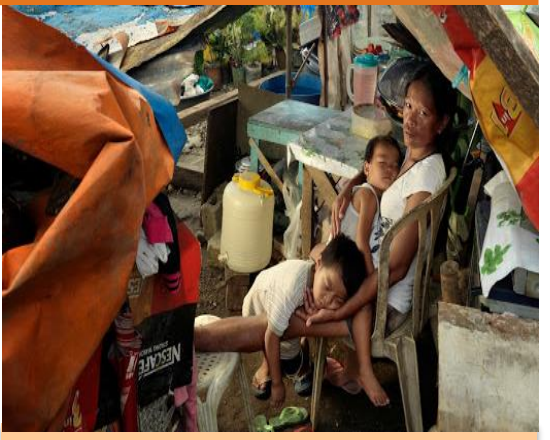
'Haiyan destroyed the second poorest region in the Philippines'

As we continued to reach needy families with food supplies, CARE also mobilized our local partners to assist in providing survivors with shelter repair kits and initial cash transfers to support the recovery of livelihoods.