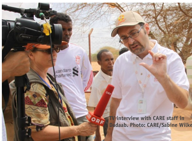
TV interview with CARE staff in Dadaab.

One of the most horrific aspects of the crisis in the Horn of Africa is an epidemic of sexual violence against refugees and displaced people. Reporters have gravitated to the story and, naturally, have asked CARE and other NGOs to facilitate interviews with survivors. Some refugees have agreed to tell their stories. But will they be safe if their identities are revealed? Field staff were shocked when one network broadcast the face and name of a woman interviewed. She had agreed to it, and signed a release form, the producers protested. But could a