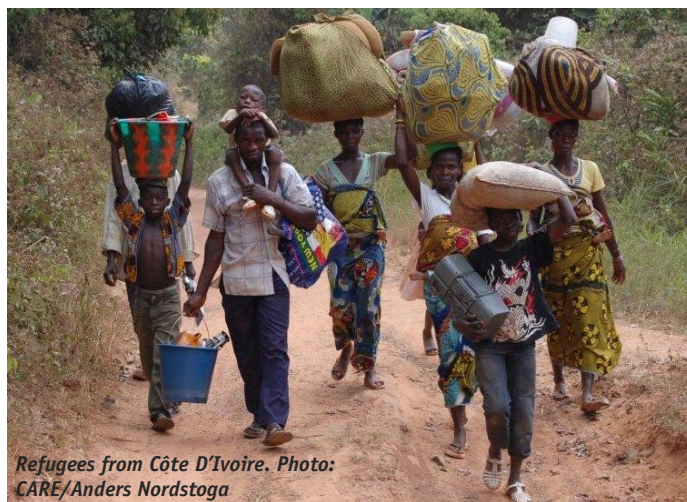
Refugees from Côte D'Ivoire.

Population reached by CARE: 15,000 (Liberia), 283,167 (Cote D'Ivoire)