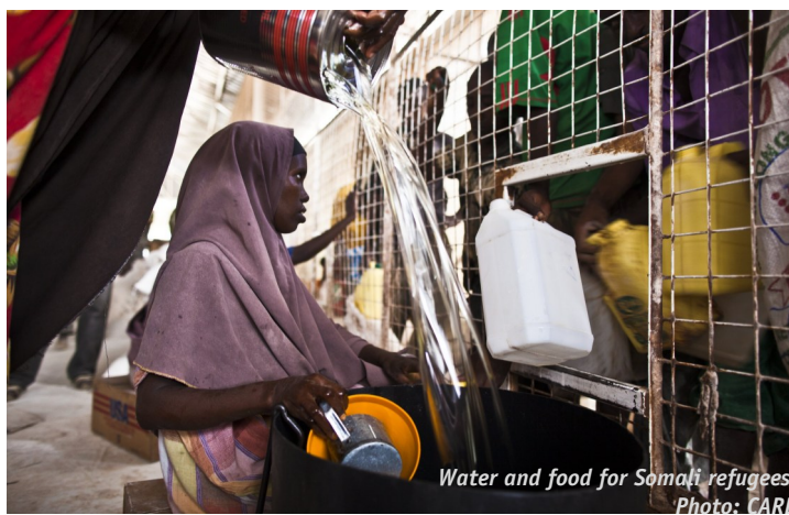
Water and food for Somali refugees

The Horn of Africa has been suffering from the worst drought in more than 60 years, affecting more than 13 million people. CARE continues to provide immediate relief to the affected communities while placing an equally high priority on long-term projects to help reduce the risk to inevitable future droughts and has reached more than 1.8 million people. CARE is scaling up its activities in northern Kenya through Cash-for-Work programs and the rehabilitation of water points. Vaccination of animals helps pastoralists keep their herds alive despite the drought. In North-