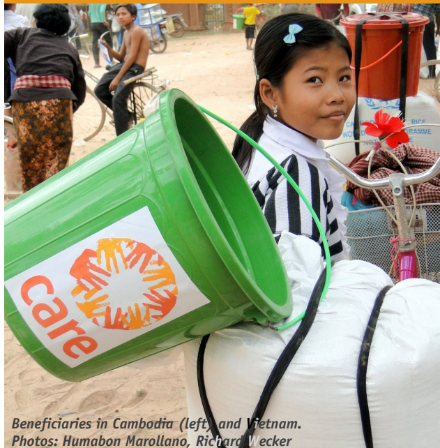
Beneficiaries in Cambodia (left) and Vietnam.