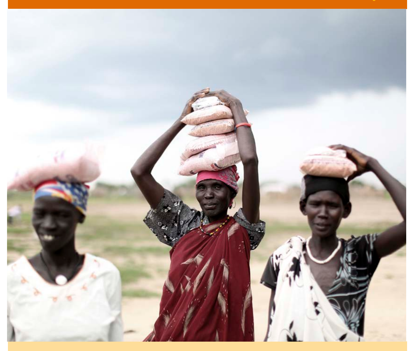
A call to action on gender and humanitarian reform From the Call to Action on Violence Against Women and Girls in Emergencies to the World Humanitarian Summit