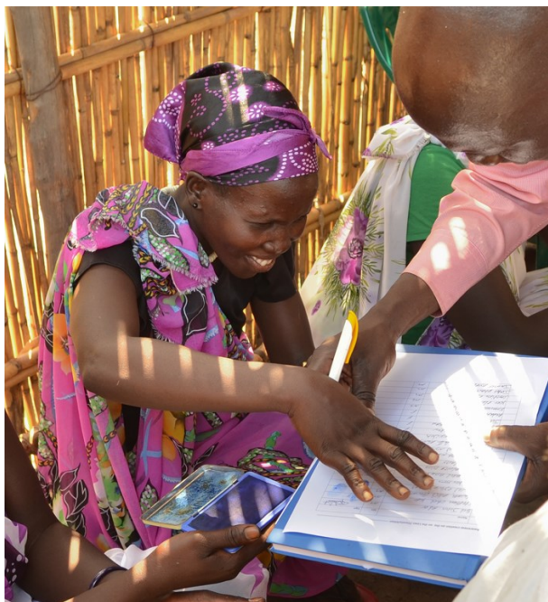
A woman in Nagdiar Payam, Baiet, Upper Nile State uses a thumbprint to register her participation in CARE workshop on the importance of local participation to the development of good governance.

Conflict does not simply generate heightened levels of GBV in a vacuum; rather, conflict can draw upon and expose underlying prejudice and gender discrimination. The following section examines the context of GBV in South Sudan.