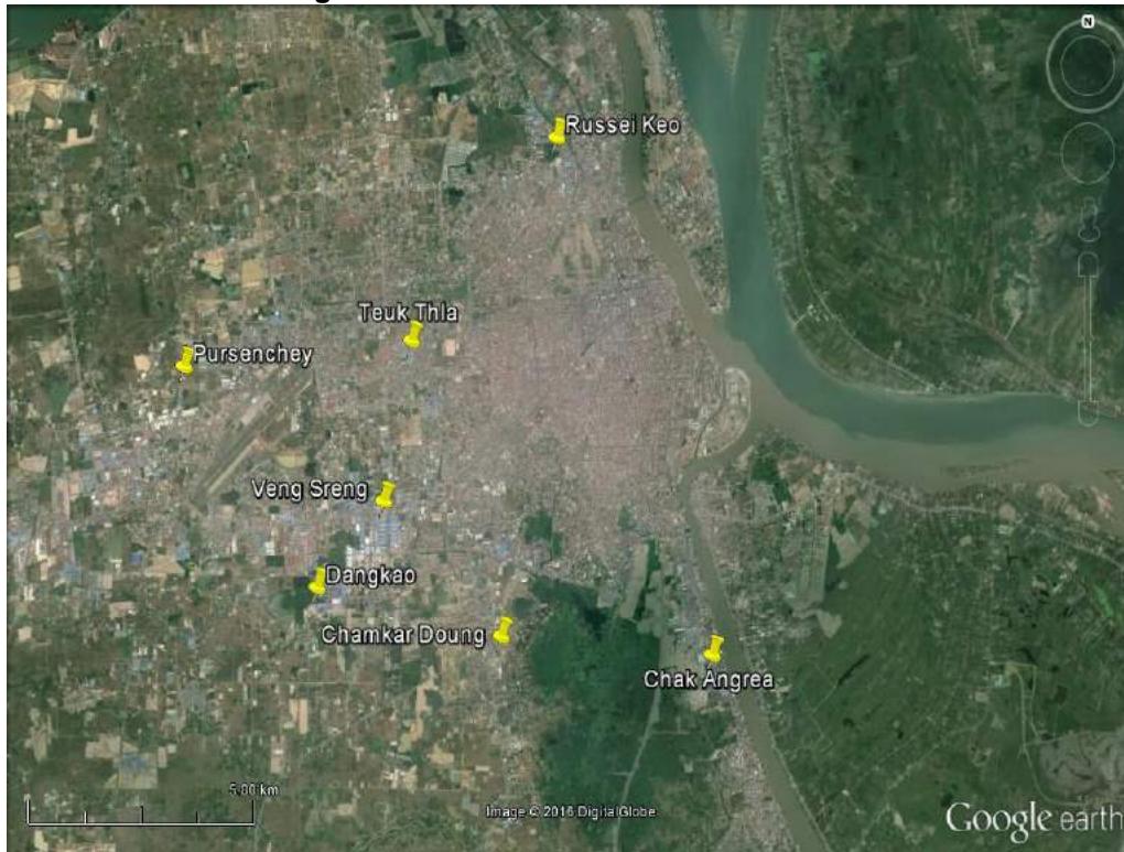
Figure 1. Qualitative interview locations

Map of Phnom Penh showing qualitative research locations. Locations were selected to be geographically dispersed in order to capture responses from women with a broad experience of different working and living conditions. There are no factories in the centre of town and most factories are located on the periphery of the city, where land prices are cheaper and there is better access to arterial roads for transport of goods. Factories are often clustered in groups around national roads, surrounded by high density 'rented room' [ bantup juol ] housing.